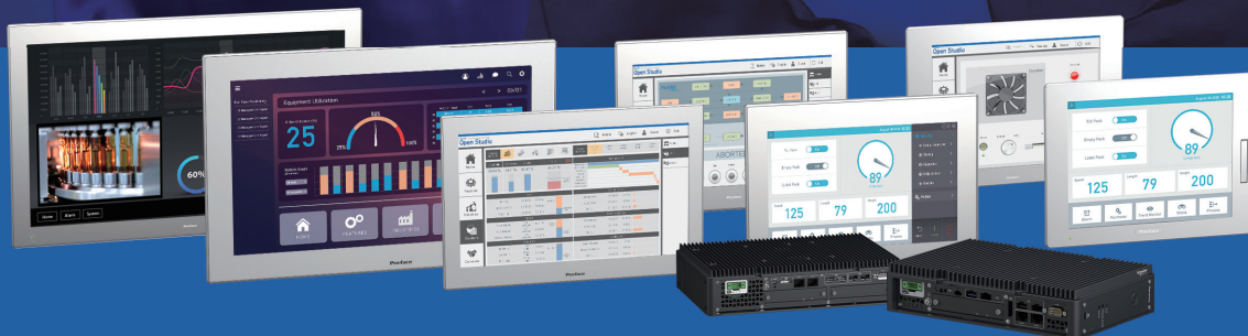
Industrial PC PS6000 Series

Improve your productivity with the most reliable PC-based architecture experience.